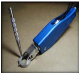
The Gebauer EpiLift uses an applanator bar to help maintain

The EpiLift System allows the eye to re-grow the connections with the epithelium, resulting in a safer procedure with a significantly lower risk of complications.